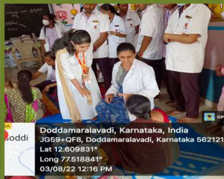
Doddamaralavadi, Karnataka, India JG59+QF8, Doddamaralavadi, Karnataka 562121, Lat 12.609831° Long 77.518841° 03/08/22 12:16 PM