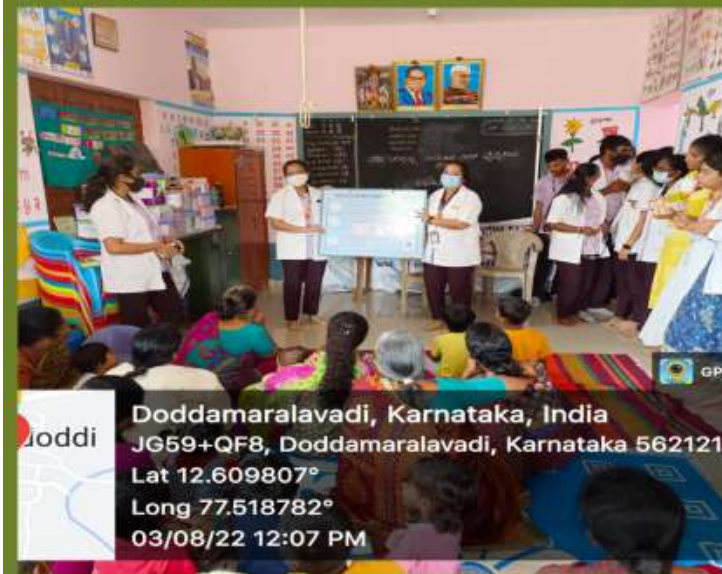
Doddamaralavadi, Karnataka, India JG59+QF8, Doddamaralavadi, Karnataka 562121, Lat 12.609807° Long 77.518782° 03/08/22 12:07 PM