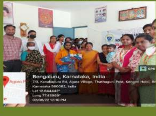
Bengaluru, Karnataka, India 7/3, Kanakapura Rd, Agara Village, Thathaguni Post, Kengeri Hobli, Bengaluru, Karnataka 560082, India Lat 12.84442° Long 77.48969° 02/08/22 12:10 PM