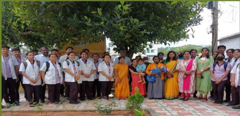
Bengaluru, Karnataka, India 7/3, Kanakapura Rd, Agara Village, Thathaguni Post, Kengeri Hobli, Bengaluru, Karnataka 560082, India Lat 12.84449° Long 77.489632° 02/08/22 12:13 PM