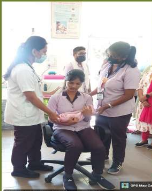
Bengaluru, Karnataka, India 7/3, Kanakapura Rd, Agara Village, Thathaguni Post, Kengeri Hobli, Bengaluru, Karnataka 560082, India Lat 12.844436° Long 77.489672° 02/08/22 11:48 AM