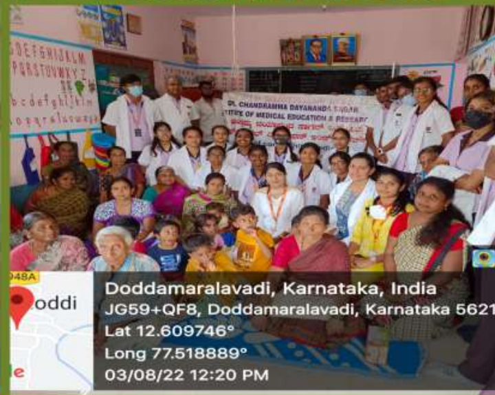
Doddamaralavadi, Karnataka, India JG59+QF8, Doddamaralavadi, Karnataka 5621 Lat 12.609746° Long 77.518889° 03/08/22 12:20 PM